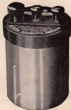
AMRAD M.E. CONDENSER No. 2747 Price $8.00

Bulletin E sent free on request describes both the AMRAD "S" TUBE RECTIFIER and MERSHON ELECTROLYTIC CONDENSER and gives wiring diagrams. Complete Amrad Catalog 10 cents in stamps.